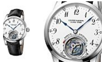
Six Watches from Baselworld that Eschew... (Robb Report)