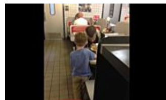
5-year-old shares compassion with homeless man