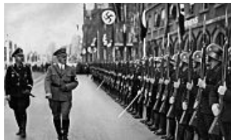
When the Nazis Courted the KKK (OZY)