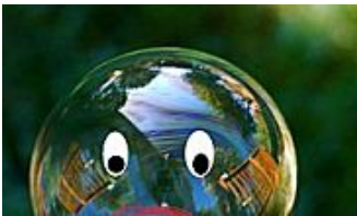
Welcome To The Everything Bubble: The Overvalued (TalkMarkets)