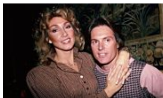
Linda Thompson on her relationships with Bruce Jenner