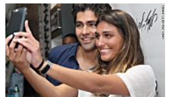
Look at me! 24 selfies of the week