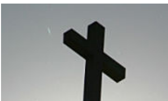
No, American Christianity is not dead