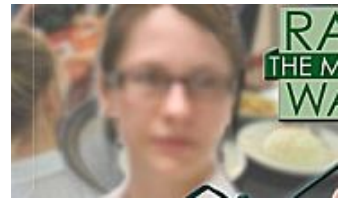
And So It Begins... Minimum Wages Raised To $15 In (Penny Stock Observer)